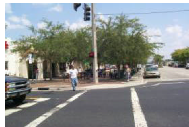
View Across Main Street at Lemon Avenue Mall Outdoor Space