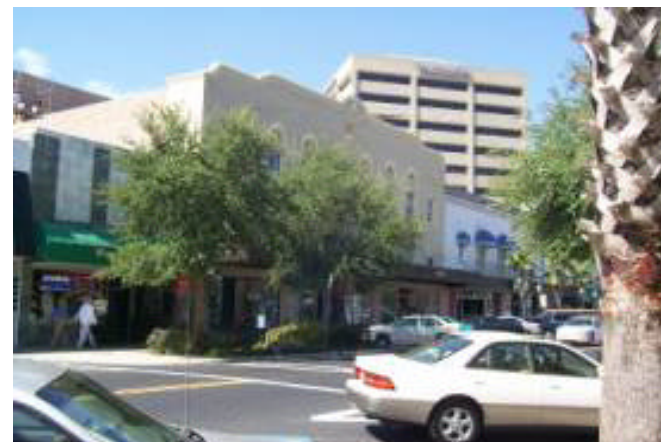
View of Main Street East of Five Points