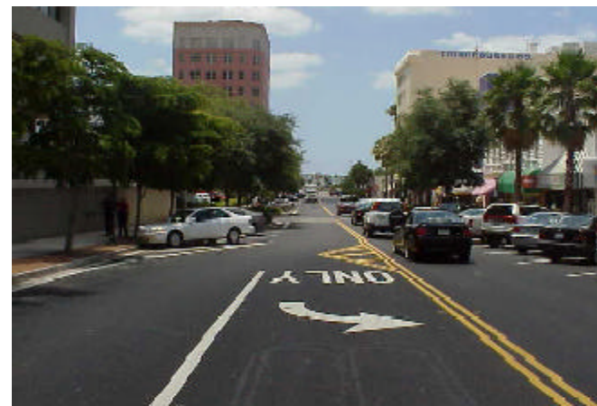
View of Main Street Looking South-West

Reduce the use of shrubs and bushes to a bare minimum. (Further discussion of recommended varieties of trees and shrubs is provided in the Landscape Standards included in this Master Plan.) Provide a variety of opportunities for sitting, including increased seating in outdoor cafes.